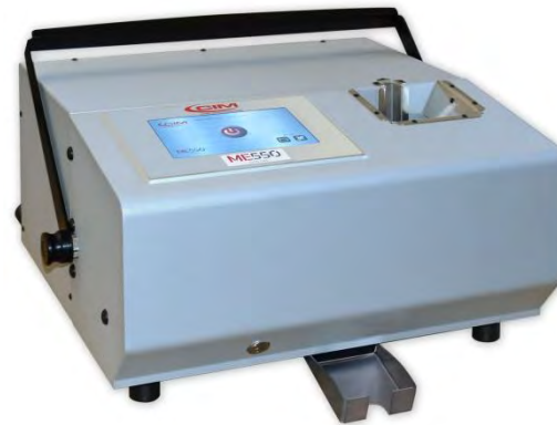
ME550 DOG TAG